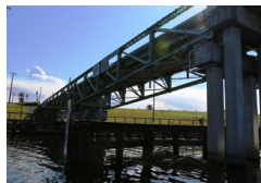
Torrey Island Swing Bridge

Slim's Fish Camp is a story in itself, not only as a one-stop shop for a day of fishing but the proprietor, Charles Corbin, operates the only manually-operated swing bridge in the state. Point Chosen Bridge crosses the Rim Canal and is opened by hand crank on demand during daylight hours for boaters that are navigating the edge of Lake Okeechobee.