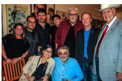
Crew On Set with Burt