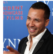
Howie D. from the Backstreet Boys