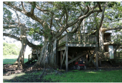
Kreamer Tree House

For filmmakers seeking a remote destination, it doesn't get more remote than Kreamer Island . The island is home to a giant treehouse with separate rooms, built as a shelter for those seeking refuge from stormy weather. Should a storm come up in Lake Okeechobee, boaters can wait it out. Also on site are several enormous banyan trees and local wildlife to make an interesting story with zero urban clutter in the skyline and waterway sunsets that are simply spectacular.