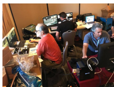
Control Room for Honda Classic Live