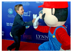
Student on Red Carpet