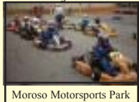
Moroso Motorsports Park