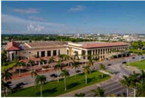
Exterior of the Palm Beach County Convention Center

With soaring windows, a ceiling of rich Brazilian mahogany, first-class meeting space and an expertly trained team of service professionals, the Palm Beach County Convention Center has staked its claim as one of South Florida's premier venues for conventions, tradeshow and social events. The facility is conveniently located minutes for Interstate 95 and Florida's Turnpike, five minutes from Palm Beach International Airport and ten minutes from the beautiful South Florida Beaches.