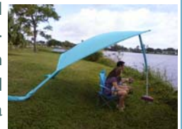
Sun Sail Cabanas Infomercial filming at John Prince Park