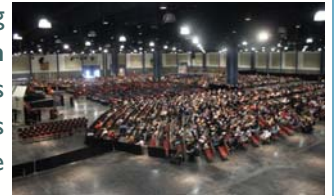
Exhibit Hall at the Palm Beach County Convention Center

With soaring windows, a ceiling of rich Brazilian mahogany, first-class meeting space and an expertly trained team of service professionals, the Palm Beach County Convention Center has staked its claim as one of South Florida's premier venues for conventions, tradeshow and social events. The facility is conveniently located minutes for Interstate 95 and Florida's Turnpike, five minutes from Palm Beach International Airport and ten minutes from the beautiful South Florida Beaches.