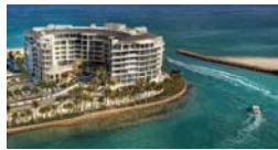
One Thousand Ocean

Production on the feature film Parker created quite a buzz! Parker is the first Donald Westlake adaptation to officially name its 'criminal with a conscience' by his true name, Parker . The film shot in many of the County's most picturesque locations including One Thousand Ocean , the Boca Raton Resort & Club and G-Star Studios .