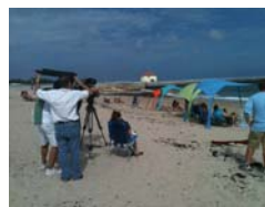
Sun Sail Cabanas Infomercial filming at Ocean Inlet Park

Commercials, infomercials and still photography shoots are some of the most lucrative facets of the production industry in Palm Beach County (PBC). One reason companies continually choose PBC is because of the diverse locations. From sultry surf to quaint campgrounds, PBC has the look and feel that accentuates a wide variety of productions.