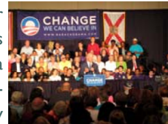
Joe Biden holding a rally