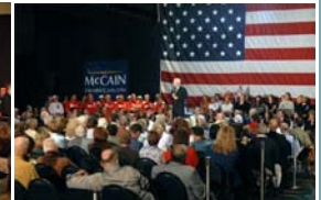
John McCain holding a rally