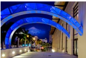
Architectural Details at the Convention Center

Nine tractor trailer size docks are available for use by crew members with one large ramp enabling easy access to the exhibit hall complemented by a 36 foot wide service road. The feature film Parker starring Jennifer Lopez and Jason Statham utilized the Convention Center as a parking lot for many vehicles and trailers, and multiple conference rooms to feed their crew members and talent. It also served as a venue for political rallies during the 2008 Presidential election. For more information on the Palm Beach County Convention Center call 561.233.1000 or visit pbfilm.com .