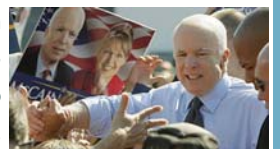
Then candidate John McCain in Florida

During 2008 election, PBC hosted several visits from both tickets, and the media took notice. Wyatt Cenac , a correspondent with The Daily Show with Jon Stewart came to Delray Beach twice to film segments with local seniors, and FAU in Boca Raton welcomed over 500 media representatives during a GOP debate. For info visit lynn.edu .