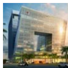
Digital Domain Rendering

The FSU College of Motion Picture Arts and the Digital Domain Institute held an open information session for high school students, incoming college freshman and transfer students to learn about the new program for digital artists that will be offered in West Palm Beach. The program offers a unique opportunity for students to pursue a Bachelors of Fine Arts in Animation and Digital Arts from The Florida State University while receiving industry-level professional certification from the Digital Domain Institute.