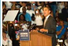
Then candidate Barack Obama at a campaign event

During 2008 election, PBC hosted several visits from both tickets, and the media took notice. Wyatt Cenac , a correspondent with The Daily Show with Jon Stewart came to Delray Beach twice to film segments with local seniors, and FAU in Boca Raton welcomed over 500 media representatives during a GOP debate. For info visit lynn.edu .