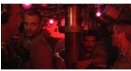
Scene from USS Sea Viper