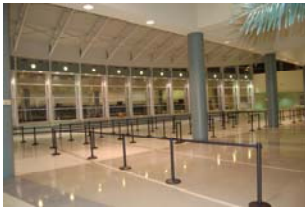
Terminal at the Port

The Bahamas Celebration Cruise Ship is based at the port, and offers 2-night cruises to Grand Bahama Island. When you arrive at the cruise terminal, you will be met by a valet parking attendant and your cruising experience has begun. Cruise employees can be filmed assisting cruisers with unloading their luggage and directing them onto baggage check-in.