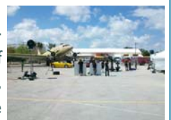
G-Star Photo in P3

P3 is a monthly magazine that updates industry professionals on the next generation of tools and techniques used in preproduction, production and post-production. For more information please visit p3update.com .