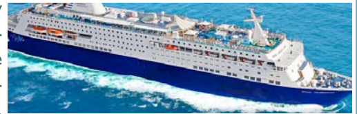
Bahamas Celebration Cruise Ship

For more info visit pbfilm.com or call 561.233.1000.