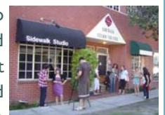
S.T.A.R.S. at the Sidewalk Studio