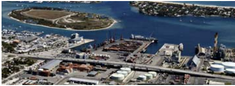
The Port of Palm Beach

The Port of Palm Beach is located Riviera Beach in Palm Beach County. Located 80 miles north of Miami and 135 miles south of Port Canaveral, the Port of Palm Beach is the fourth busiest container port of Florida's fourteenth deep-water ports and is the twentieth busiest in the