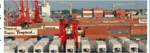
Containers at the Port of Palm Beach

The Port of Palm Beach is located Riviera Beach in Palm Beach County. Located 80 miles north of Miami and 135 miles south of Port Canaveral, the Port of Palm Beach is the fourth busiest container port of Florida's fourteenth deep-water ports and is the twentieth busiest in the