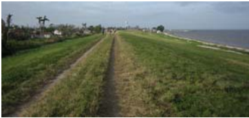
Lake Okeechobee Scenic Trail

Located just north of Torry Island, accessible only by airboat during the wet season and by recreational vehicles during dry season, you will discover the overgrown tree-lined Kreamer Island . The island was settled as a fishing and agricultural settlement in the 1800's. It suffered numerous casualties over the years from fires and hurricanes, including one in the 1920s, during which over 1,000 people around the lake perished. Little is left standing and the island is now considered a ghost town to most, but not air boaters. This island is home to one of the largest public tree houses in the state. Built by the Belle Glade Buggy and Airboat Association as a gathering hole for wildlife, air boaters and tourists, it offers a great location for your next scary movie or ghostly scene. Built in and around incredible Banyan trees with decks that offer breathtaking views on all sides, the tree house is very unique. Catch some zzz's on the hammock, sit on the swinging bench or play on the rope swings found across the front yard. If your crew is feeling adventurous bring your sleeping bags and stay the night. While you are in the area schedule one of the many gator sightseeing tours that are available both during the day and at night. Witness the excitement of trapping Florida's wild beasts in their natural habitat. For info call 561.233.1000.