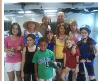
Cast of Gina and the G.I.T.