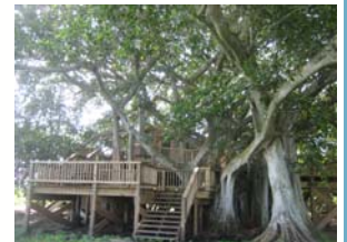
Kreamer Island Tree House

some zzz's on the hammock, sit on the swinging bench or play on the rope swings found across the front yard. If your crew is feeling adventurous bring your sleeping bags and stay the night. While you are in the area schedule one of the many gator sightseeing tours that are available both during the day and at night. Witness the excitement of trapping Florida's wild beasts in their natural habitat. For info call 561.233.1000.