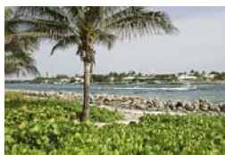
Jupiter Beach Park

The Real World New Orleans is the 24 th installment of the show that revolves around eight strangers who are picked to live in a house and have their lives taped. Catch The Real World Wednesdays at 10/9c. For more information please visit mtv.com .