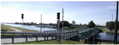
Torry Island Bridge

Just minutes from the City of Belle Glade , Torry Island is located on the southeastern rim of Lake Okeechobee featuring a wonderland of wildlife, sawgrass and lily pads. People from all over the world come to experience its serene beauty. The island provides 350 campsites and eight public boat ramps all of which provide access to Lake Okeechobee and the scenic walking trail on the island. Common activities include fishing, gator and wildlife watching, kayaking, airboat rides, and canoeing. The island has a rugged, natural feel to it, and though you are only minutes away from motels, stores, and restaurants, you are surrounded by native wildlife that provides a pristine setting for your production. Torry Island is also home to the Point Chosen Bridge , the oldest swing draw-bridge in Florida. It's the only bridge in Florida that has to be hand-cranked to be opened. For 75 years, the bridge has connected the mainland levee to Torry Island in Lake Okeechobee. It's one of the last of its kind and has a special place in Florida history.