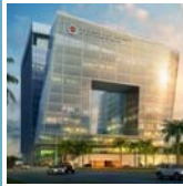
Digital Domain Rendering

Legendary visual effects house, Digital Domain ( Titanic , The Day After Tomorrow ) is in talks with West Palm Beach city officials about bringing a digital animation college to the area. Florida State University would have a film school at the site, and students would learn about, and work on digital graphics projects for large-scale Hollywood films. In addition, the new facility would house an animation studio and a Digital Domain Institute. Although financial terms are still being discussed, if approved, Digital Domain would become a signature business in the downtown area. For more information call 561.233.1000.