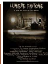
Lumiere Fantome Poster