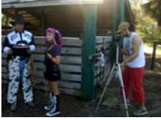
On the set of Gina and the G.I.T.