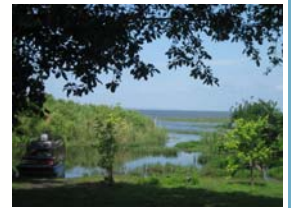
Airboat in Torry Island

Just minutes from the City of Belle Glade , Torry Island is located on the southeastern rim of Lake Okeechobee featuring a wonderland of wildlife, sawgrass and lily pads. People from all over the world come to experience its serene beauty. The island provides 350 campsites and eight public boat ramps all of which provide access to Lake Okeechobee and the scenic walking trail on the island. Common activities include fishing, gator and wildlife watching, kayaking, airboat rides, and canoeing. The island has a rugged, natural feel to it, and though you are only minutes away from motels, stores, and restaurants, you are surrounded by native wildlife that provides a pristine setting for your production. Torry Island is also home to the Point Chosen Bridge , the oldest swing draw-bridge in Florida. It's the only bridge in Florida that has to be hand-cranked to be opened. For 75 years, the bridge has connected the mainland levee to Torry Island in Lake Okeechobee. It's one of the last of its kind and has a special place in Florida history.