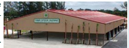
Agriplex at the Fairgrounds

Projects that have filmed at the Fairgrounds include the Travel Channel's Ghost Adventures which shot at Yesteryear Village and The Barrett Jackson Car Auction for the Speed Channel. For info call 561.233.1000.