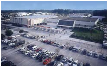
South Florida Fairgrounds

The South Florida Fairgrounds home of the South Florida Fair, which runs from January 16 to February 1 is a very film-friendly location in Palm Beach County. Located in West Palm Beach on approximately 130 acres, the Fairgrounds are made up of a variety of diverse areas including the Americraft Expo Center, the Concourse buildings, the Agriplex, the Cruzan Amphitheatre and Yesteryear Village.