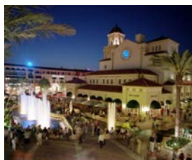
CityPlace in West Palm Beach

The December edition of P3 Update , a monthly trade publication, published a feature story on the 'Top 10 Locations in the World'. The photo that introduced the article was a spectacular photo of CityPlace in West Palm .