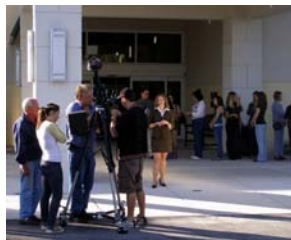
Wellington Branch Library