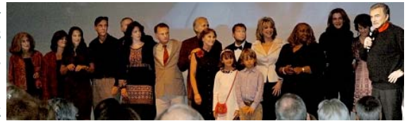
Burt Reynolds and his students on stage at the Maltz

The Palm Beach County Film and Television Commission in partnership with the Palm Beach County Economic Development Office donated $15,000 worth of video equipment to the Burt Reynolds and Friends Museum in Jupiter . The equipment is being utilized by students of the museum for several educational projects. One of those projects was an eight week "Acting for the Camera Workshop" taught by Burt Reynolds. The result was this premiere presentation of the "Burt Reynolds Institute for Film and Theatre Night of Filmed and Edited Scenes." The event was held at the Maltz Jupiter Theatre . For more info call 561.233.1000.