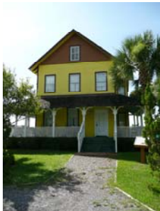
Riddle House at Yesteryear Village

The Concourse buildings offer 38,252 square feet of exhibit space within 10 different rooms, which can be mixed and matched to meet your exact needs. The Agriplex has a large animal barn and a large animal show ring covering 51,000 square feet of usable space.